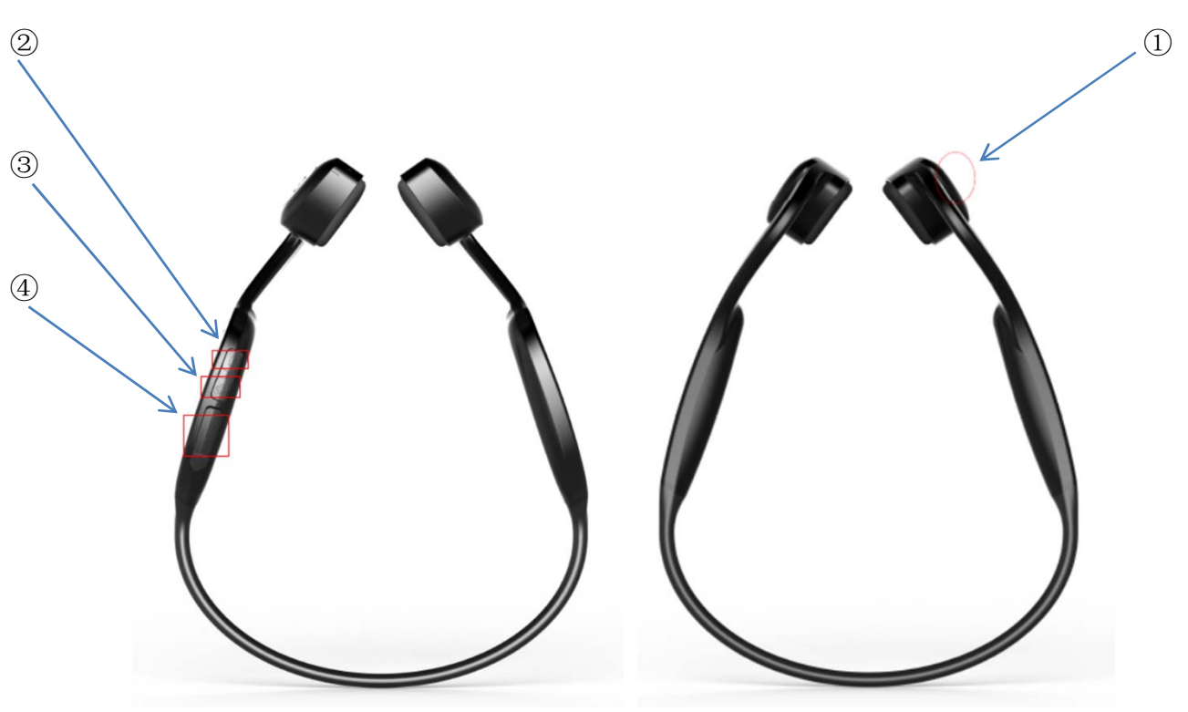
Part 2. Component position description of bone conduction headset

Bone conduction earphones do not need to be inserted into or cover the ears, but the vibration unit (commonly known as: vibrator or speaker) is attached to the temporal bone protrusion in front of the human ear. It will be very comfortable to wear correctly and will not cause any burden on the ear and neck