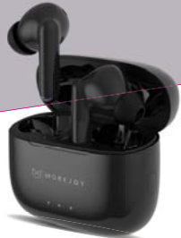
MJ141 quick guide